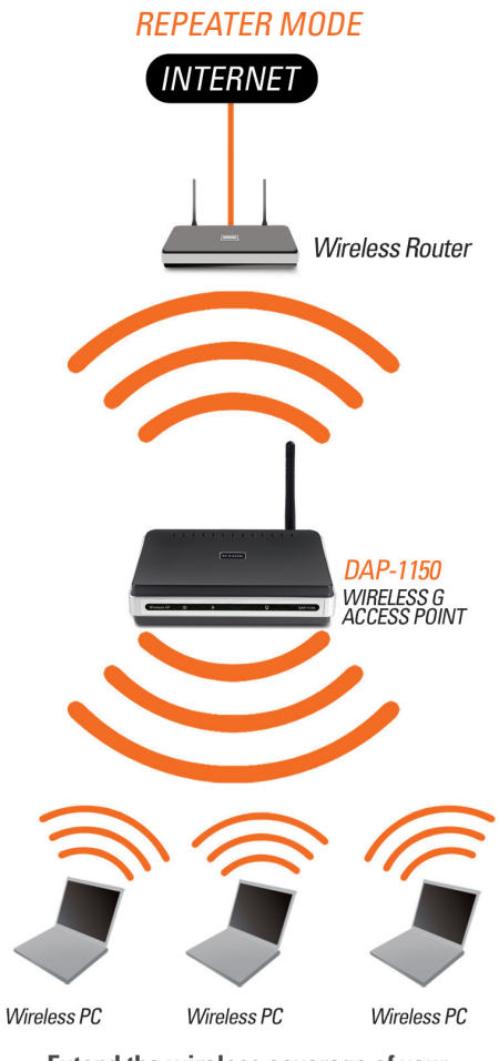
Extend the wireless coverage of your wireless router with the DAP-1150