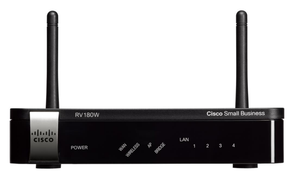
Figure 1. Cisco RV180W Multifunction VPN Router (Front Panel)

Reliable business-class multifunction router that evolves with your business needs