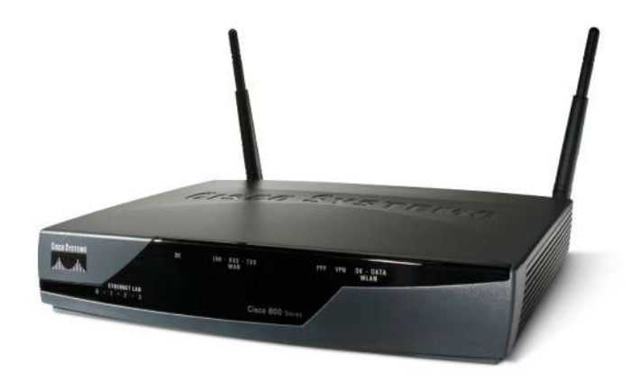
Figure 1. Cisco 871 Integrated Services Router

Table 1 lists the routers that currently make up the Cisco 870 Series.