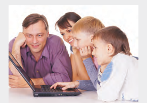
Quick & Easy Setup