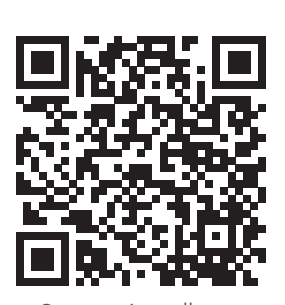
Scan to install app