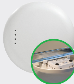
Indoor Ceiling Enclosure