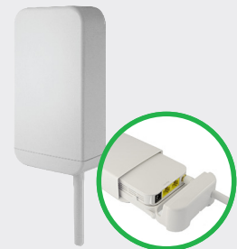
Outdoor Wall/Pole Enclosure