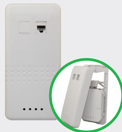
Indoor Ethernet Jack Enclosure