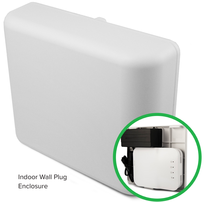
Indoor Wall Plug Enclosure

With Open Mesh enclosures and access points, you can deploy custom-tailored wireless networks at a fraction of the time and cost of traditional networks.