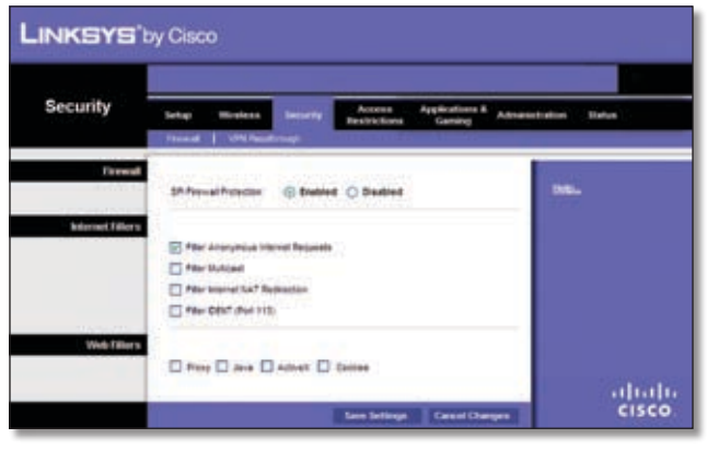
Security > Firewall

The Security > Firewall screen is used to configure a firewall that can filter out various types of unwanted traffic on the Router's local network.