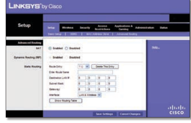
Setup > Advanced Routing

This screen is used to set up the Router's advanced functions. Operating Mode allows you to select the type(s) of advanced functions you use. Dynamic Routing automatically adjusts how packets travel on your network. Static Routing sets up a fixed route to another network destination.