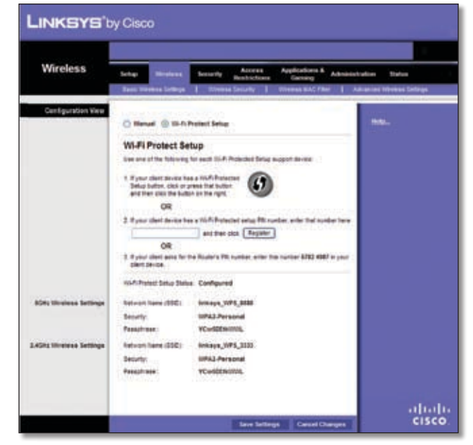
Wireless > Basic Wireless Settings (Wi-Fi Protected Setup)

There are three methods available. Use the method that applies to the client device you are configuring.