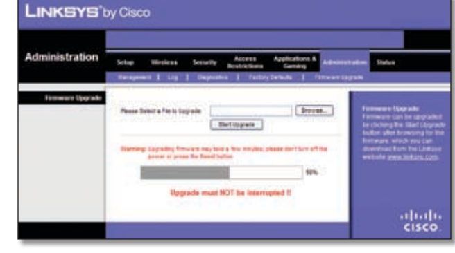
Administration > Firmware Upgrade

The Administration > Firmware Upgrade screen allows you to upgrade the Router's firmware. Do not upgrade the firmware unless you are experiencing problems with the Router or the new firmware has a feature you want to use.