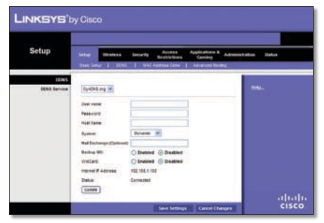
Setup > DDNS > DynDNS

User Name Enter the User Name for your DDNS account.