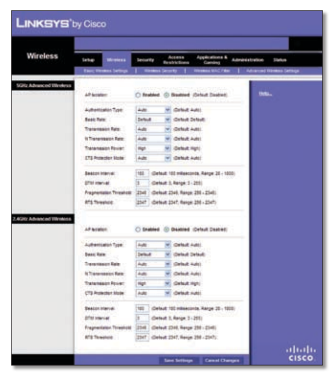
Wireless > Advanced Wireless Settings

This Wireless > Advanced Wireless Settings screen is used to set up the Router's advanced wireless functions. These settings should only be adjusted by an expert administrator as incorrect settings can reduce wireless performance.