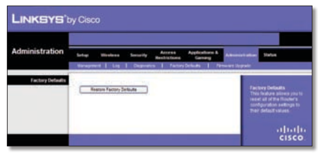
Administration > Factory Defaults

Restore Factory Defaults To reset the Router's settings to the default values, select Restore Factory Defaults . Any settings you have saved will be lost when the default settings are restored.