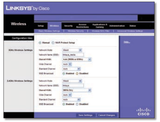
Wireless > Basic Wireless Settings

The basic settings for wireless networking are set on this screen.