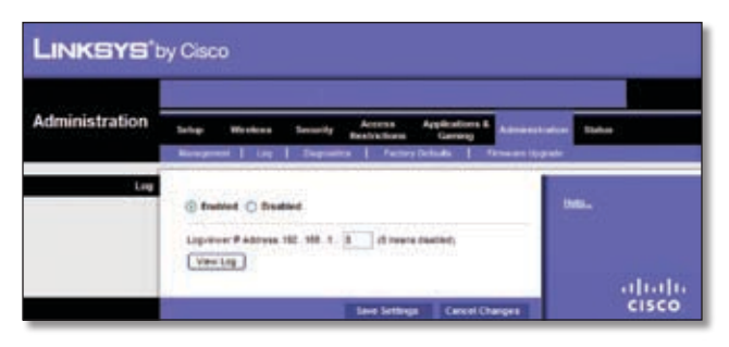
\mbox{Administration} > \mbox{Log}

The Router can keep logs of all traffic for your Internet connection.