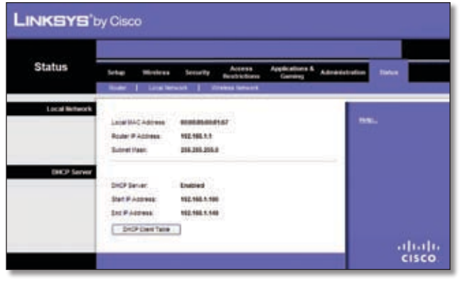
Status > Local Network

The Status > Local Network screen displays information about the local network.