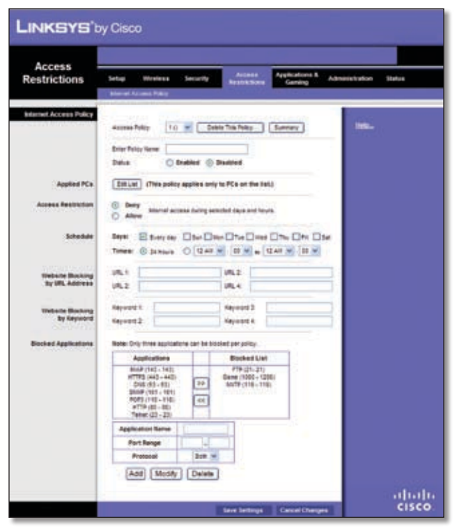
Access Restrictions > Internet Access

The Access Restrictions > Internet Access screen allows you to deny or allow specific kinds of Internet usage and traffic, such as Internet access, designated services, and websites during specific days and times.