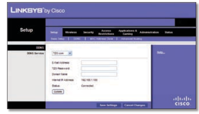
Setup > DDNS > TZO

E-mail Address, TZO Password, and Domain Name Enter the settings of the account you set up with TZO.