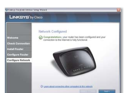
Congratulations! Setup is complete.

H. Follow the instructions until you see the Network Configured screen. Click Learn about connecting other computers to this network to view sharing options, or click Next to finish the setup.