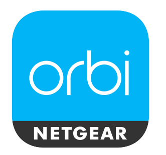
Figure 2. NETGEAR Orbi app icon

You can use the NETGEAR Orbi app to set up and monitor your Orbi Voice. To download the app, visit <u>Orbi-app.com</u>.