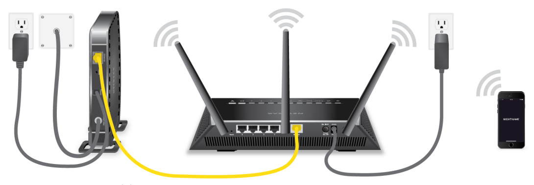
Figure 5. Router cabling

The following image shows how to cable your router. To finish the installation, download and launch the Nighthawk app on your mobile device. For more information, see <u>Install and manage your router with the Nighthawk app</u> on page 19.