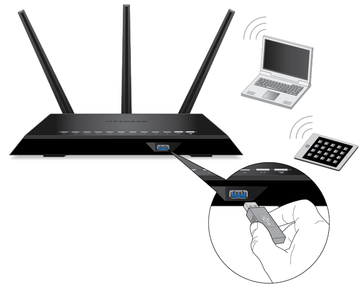
Figure 3. USB 3.0 port

A USB 3.0 port is located on the front of the router.