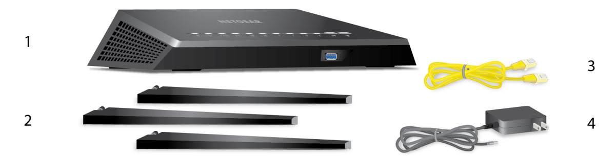
Figure 1. Package contents