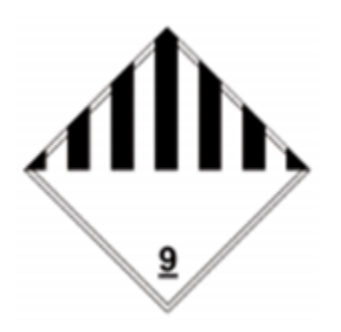
Figure143. Class 9 Hazard Symbol shipping label for batteries contained in the equipment.

The Class 9 label must be available for the proper limit battery weight per package (see Figure 14 ). This should be present on the pallets and master carton.