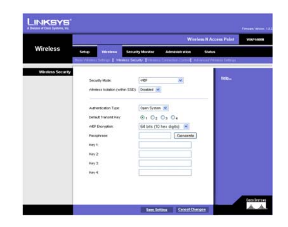
Figure 6-13: Wireless Settings - WEP