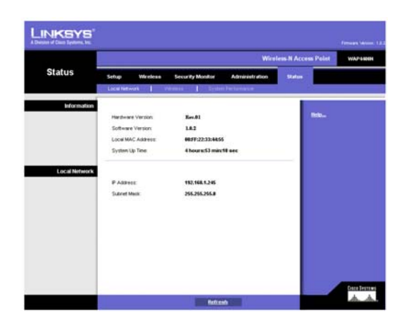
Figure 6-24: Status - Local Network

To update the status information, click the Refresh button. Help information is displayed on the right-hand side of the screen.