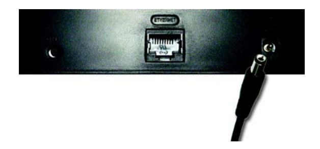
Figure 4-2: Connect the Power