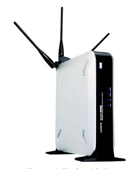
Figure 4-3: The Stand Option

Now that the hardware installation is complete, proceed to "Chapter 5: Setting up the Wireless-N Access Point," for directions on how to set up the Access Point."