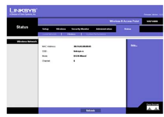
Figure 6-25: Status - Wireless

To update the status information, click the Refresh button. Help information is displayed on the right-hand side of the screen.