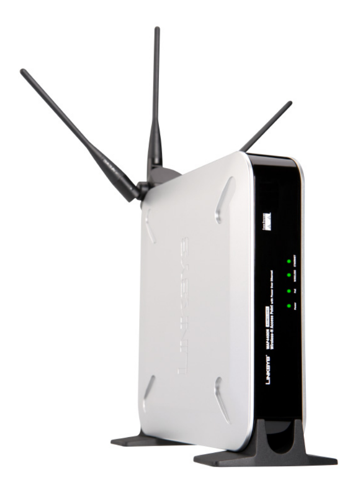
Figure 3-4: Standalone Position and its Antenna Setup