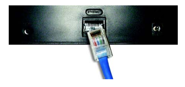
Figure 4-1: Connect the Ethernet Cable

hardware: the physical aspect of computers, telecommunications, and other information technology devices.