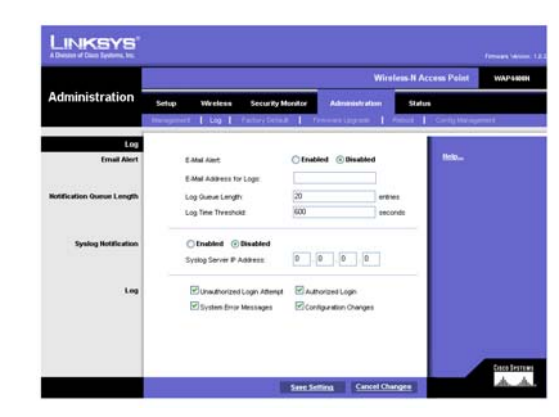
Figure 6-19: The Administration - Log

Authorized Login. If you want to log authorized logins, click the checkbox.