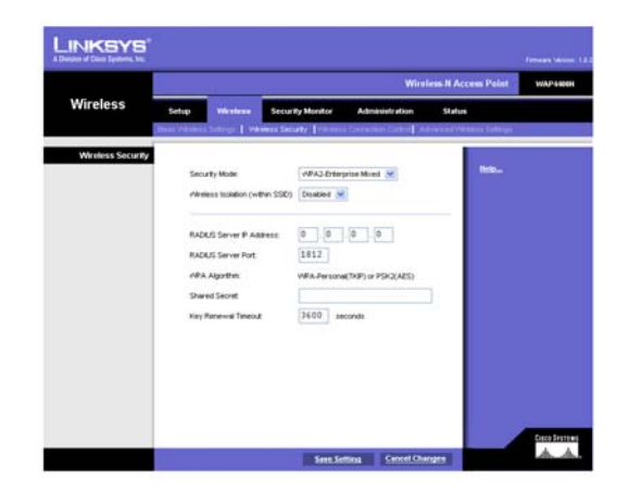
Figure 6-12: Wireless - Wireless Security (WPA2 - Enterprise Mixed)

Change these settings as described here and click Save Settings to apply your changes, or click Cancel Changes to cancel your changes. Help information is displayed on the right-hand side of the screen, and click More for additional details.