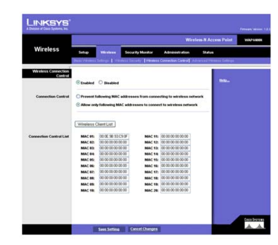
Figure 6-14: Wireless - Wireless Connection Control

Change these settings as described here and click Save Settings to apply your changes, or click Cancel Changes to cancel your changes. Help information is displayed on the right-hand side of the screen.