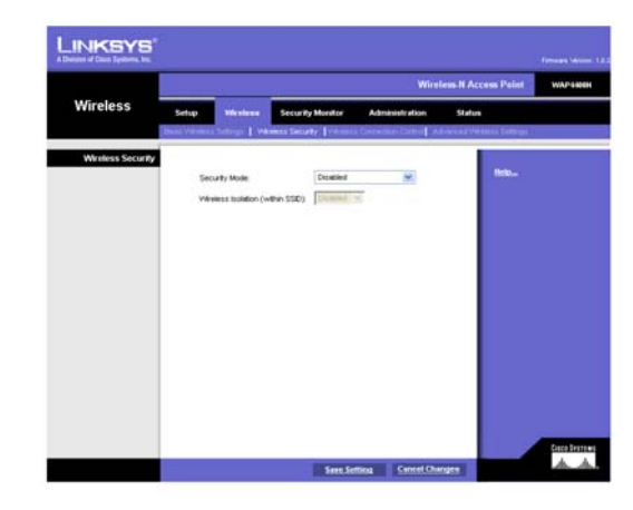
Figure 6-6: Wireless - Wireless Security (Disabled)

Key Renewal Timeout . Enter a Key Renewal Timeout period, which instructs the Access Point how often it should change the encryption keys. The default is 3600 seconds.