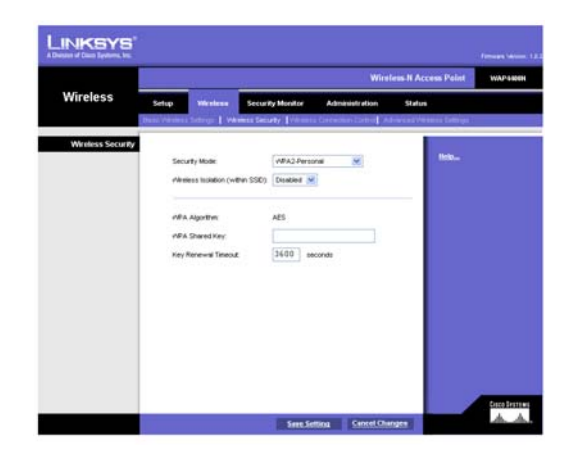
Figure 6-8: Wireless - Wireless Security (WPA2-Personal)

Key Renewal Timeout . Enter a Key Renewal Timeout period, which instructs the Access Point how often it should change the encryption keys. The default is 3600 seconds.