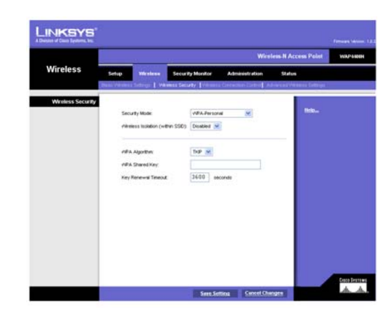
Figure 6-7: Wireless - Wireless Security (WPA-Personal)