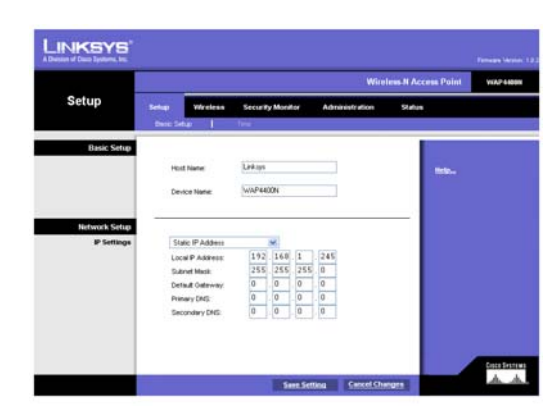
Figure 6-1: Setup - Static IP Address

IP Address. The IP address must be unique to your network. The default IP address is 192.168.1.245.