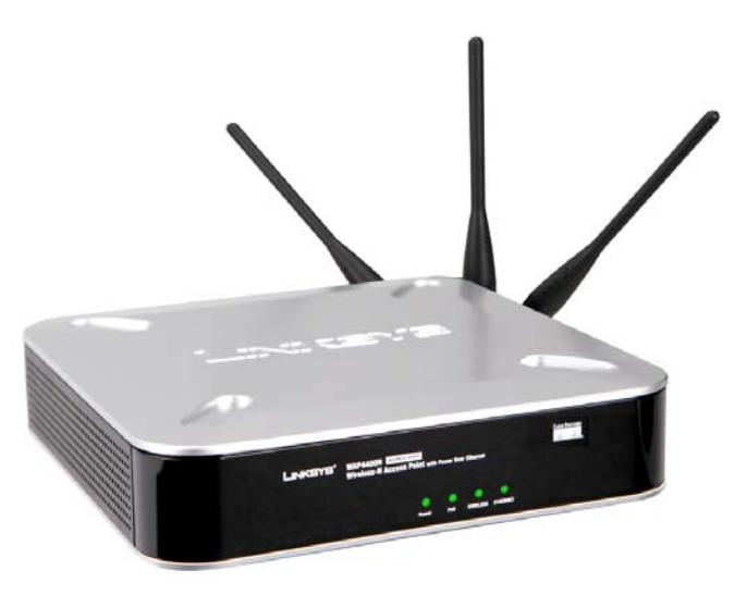
Figure 3-3: Stackable Position and its Antenna Setup

The Access Point has three non-detachable 2dBi omni-directional antennas. The three antennas have a base that can rotate 90 degrees when in the standing position. The three antennas will all be used to support 2X3 MIMO diversity in wireless-N mode.