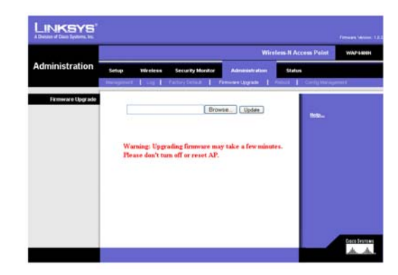
Figure C-1: Firmware Upgrade