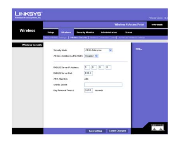
Figure 6-11: Wireless - Wireless Security (WPA2-Enterprise)