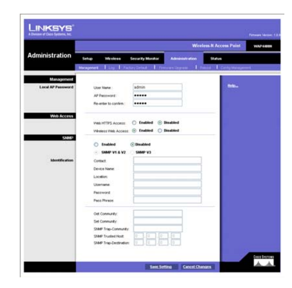
Figure 6-18: Administration - Management

To enable the SNMP support feature, select Enabled. Otherwise, select Disabled. The default is Disabled.