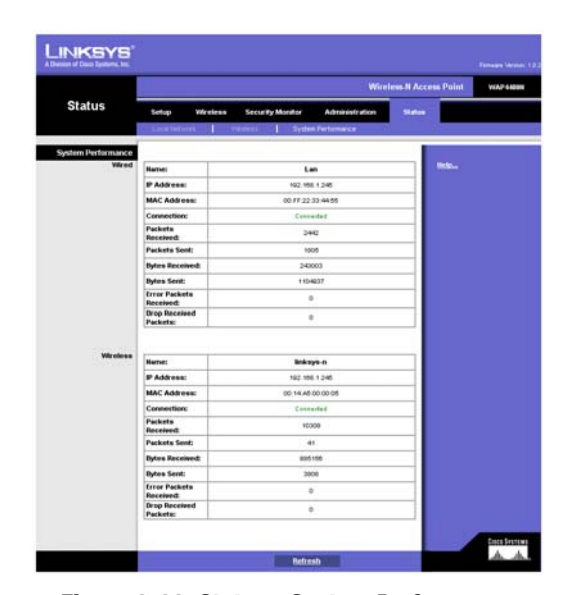
Figure 6-26: Status - System Performance

Packets Sent. This shows the number of packets sent for each wireless network.