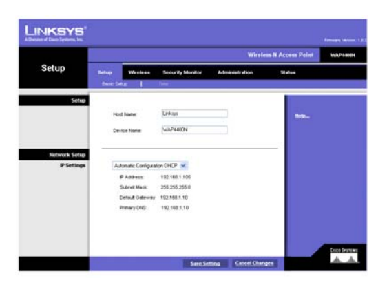
Figure 6-2: Setup - Automatic Configuration - DHCP

Change these settings as described here and click Save Settings to apply your changes, or click Cancel Changes to cancel your changes. Help information is displayed on the right-hand side of the screen.