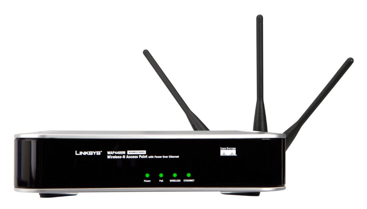
Figure 3-1: Front Panel

The Access Point's LEDs, where information about network activity is displayed, are located on the front panel.