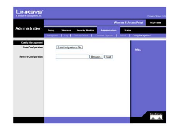
Figure 6-23: Administration - Config Management

Help information is displayed on the right-hand side of the screen.