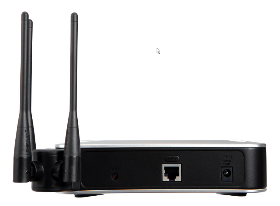
Figure 3-2: Back View

The Access Point's port are located on the back of the device.