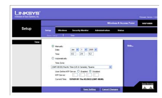
Figure 6-3: Setup - Time