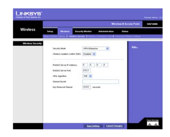
Figure 6-10: Wireless - Wireless Security (WPA-Enterprise)

Key Renewal Timeout . Enter a Key Renewal Timeout period, which instructs the Access Point how often it should change the encryption keys. The default is 3600 seconds.