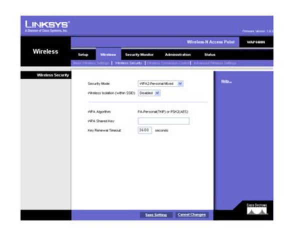
Figure 6-9: Wireless - Wireless Security (WPA2-Personal Mixed)