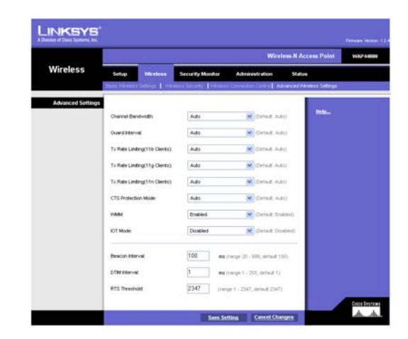
Figure 6-16: Wireless - Advanced Wireless

WMM. Wi-Fi Multimedia is a QoS feature defined by WiFi Alliance before IEEE 802.11e was finalized. Now it is part of IEEE 802.11e. When it is enabled, it provides four priority queues for different types of traffic. It automatically maps the incoming packets to the appropriate queues based on QoS settings (in IP or layer 2 header). WMM provides the capability to prioritize traffic in your environment. The default in Enabled . Select