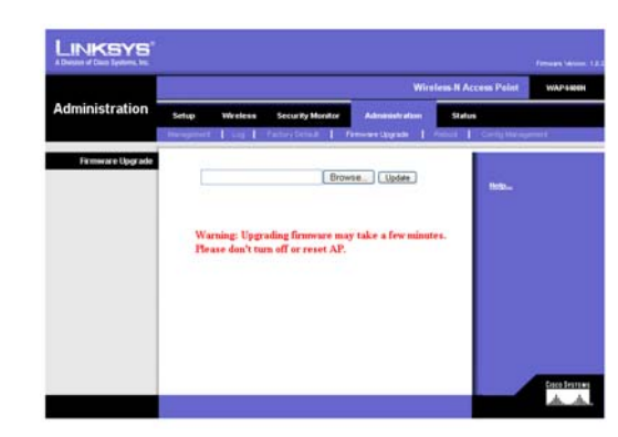
Figure 6-21: Administration - Firmware Upgrade

Help information is displayed on the right-hand side of the screen.