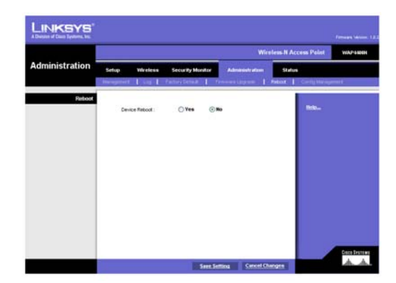
Figure 6-22: Administration - Reboot

Click Save Settings to apply your change and the Access Point will reboot itself, or click Cancel Changes to cancel your change. Help information is displayed on the right-hand side of the screen.