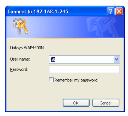
Figure 5-1: Login Screen