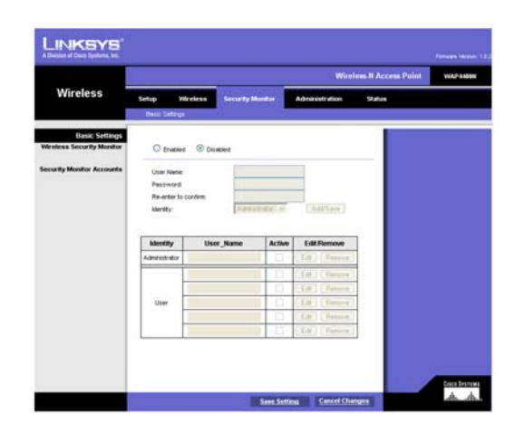
Figure 6-17: Security Monitor

Change these settings as described here and click Save Settings to apply your changes, or click Cancel Changes to cancel your changes. Help information is displayed on the right-hand side of the screen, and click More for additional details.