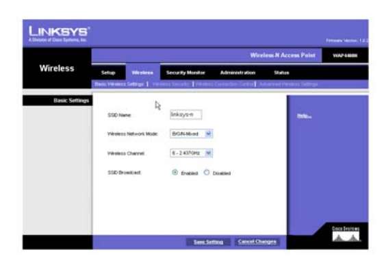
Figure 6-4: Wireless - Basic Wireless Settings

Wireless Channel. Select the appropriate channel to be used among your Access Point and your client devices. The default is channel 6. You can also select Auto so that your Access Point will select the channel with the lowest amount of wireless interference while the system is powering up. Auto channel selection will start when you click Save Settings button, it will take several seconds to scan through all the channels to find the best