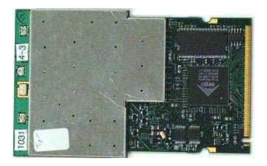
Figure 1 AGN0922AR-02

Airgo Network's AGN0922AR-01 product design is based on Airgo's advanced three-receiver AGN103BB (using two of the three available receiver chains) and AGN100RF chipset. The product is designed specifically for low cost Broadband Gateways and other similar Access Point applications. Airgo Network's patented multi-antenna technology yields enhanced range and provides data rates of up to 10 times the competition at the same range. Airgo's patented True MIMO<sup>TM</sup> multi-antenna technology enables the AGN0922AR-01 to deliver 108 Mbps data rates in a single 20 MHz channel that is legal worldwide. Full support for IEEE 802.11b/g standards allows for an unprecedented level of backwards compatibility and performance at all data rates. Airgo Networks has shattered the previous definition of range, speed giving you maximum performance and feature advantages.