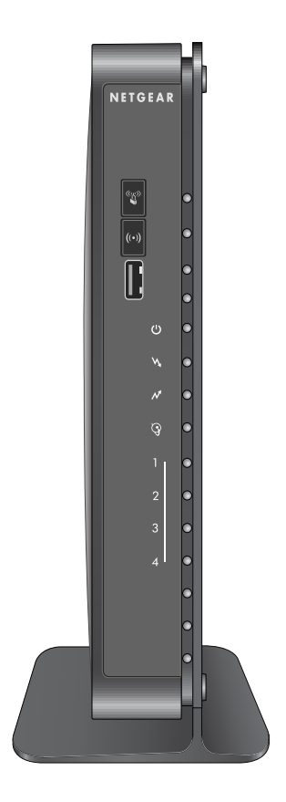
Figure 1. Gateway front view

You can use the LEDs to verify status and connections. The following table lists and describes each LED and button on the front panel of the gateway.