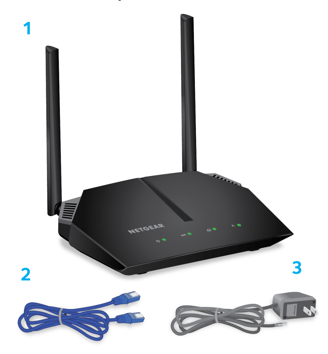
Figure 1. Package contents