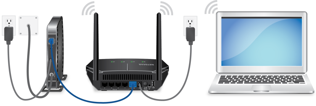
Figure 4. Router cabling

The following image shows how to cable your router: