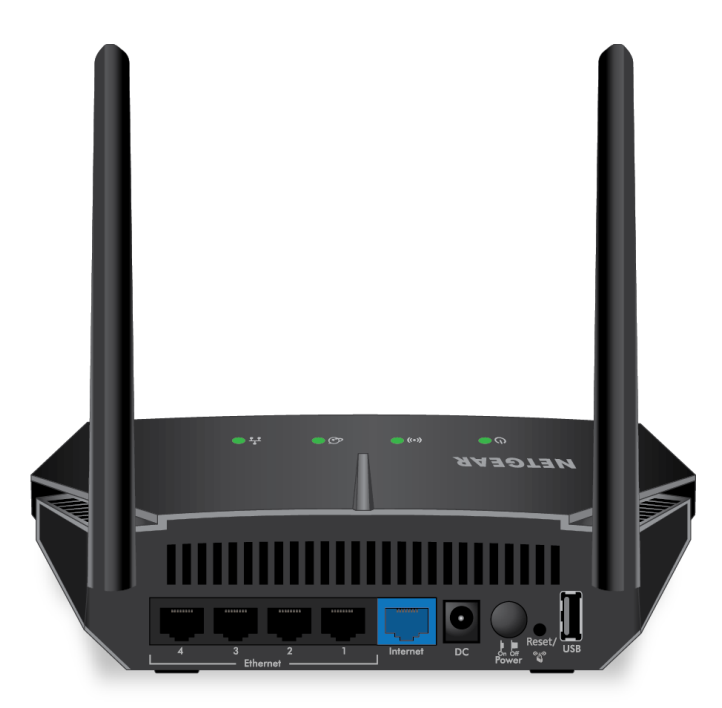
Figure 5. One USB 2.0 port is located on the back panel of the router

ReadySHARE lets you access and share a USB device connected to the router USB port. (If your USB device uses special drivers, it is not compatible.)