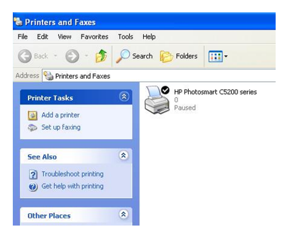
Figure 6. Printers and Faxes window

If your USB printer supports scanning, you can also use the USB printer for scanning. For example, the USB printer displayed in the Windows Printers and Faxes window is ready for print jobs.