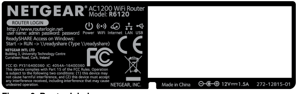
Figure 3. Router label

The router label on the bottom panel of the router lists the login information, WiFi network name (SSID) and password (network key), serial number, and MAC address of the router.