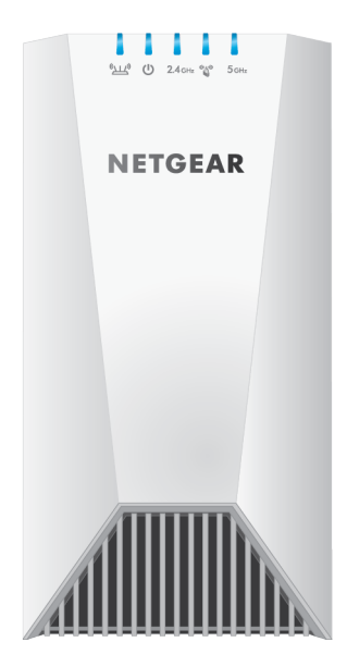
Figure 1. Front panel