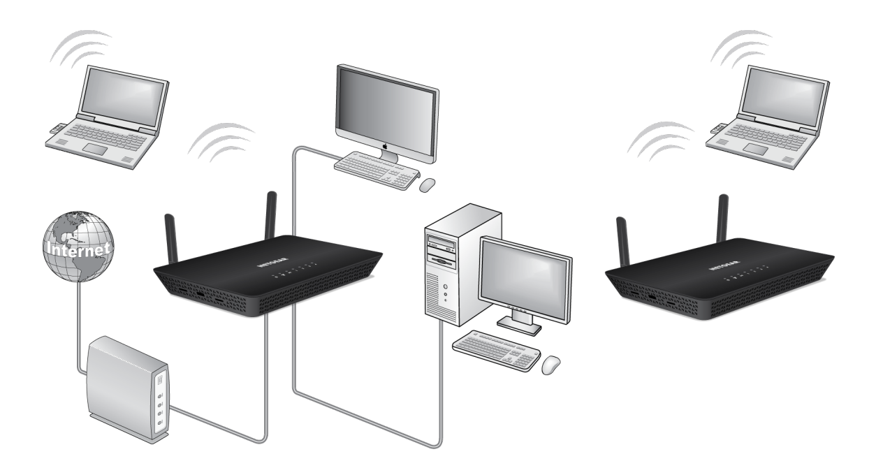
Figure 6. WiFi repeating scenario with a point-to-point configuration

To use the WiFi repeating function, you cannot use the auto channel feature for the access point, the SSID broadcast must be enabled, and you cannot use WPA and WPA2 enterprise security.