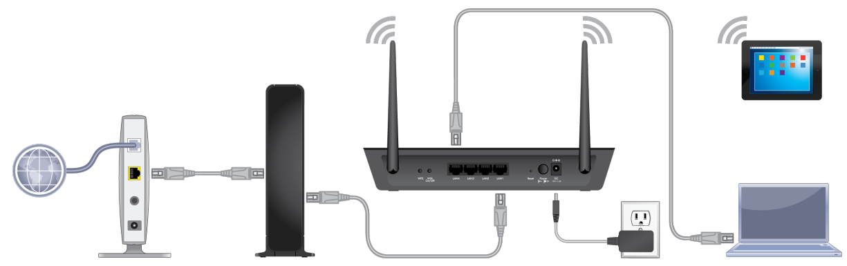
Figure 5. Connect the access point to a router

By default, the DHCP client of the access point is enabled, so the access point receives an IP address from your router (almost any router functions as a DHCP server) or from a DHCP server in your network.