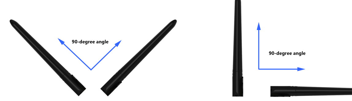
Figure 3. Examples of recommended antenna positions

Although you can swivel the antennas in any direction, for best performance, we recommend that you position the access point's antennas perpendicular to each other, that is, at a 90-degree angle.