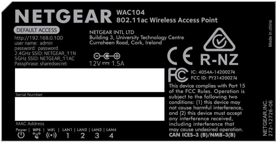
Figure 4. Access point label

The access point label on the bottom panel of the access point shows the default login information, default WiFi network names (SSIDs), default WiFi passphrase, serial number and MAC address of the access point, and other information.