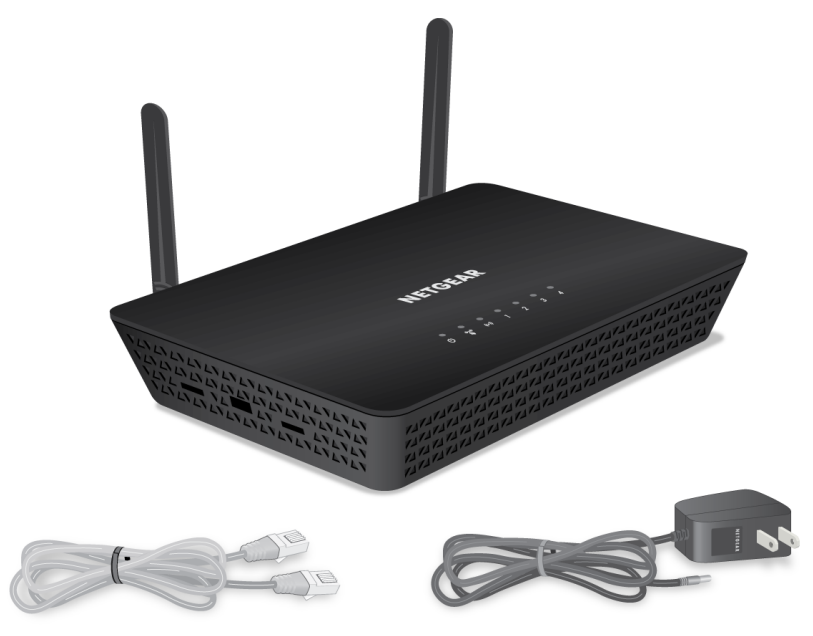
Figure 1. WAC104 package contents

The package contains the access point, Ethernet cable, power adapter (localized to the country of sale), and installation guide.