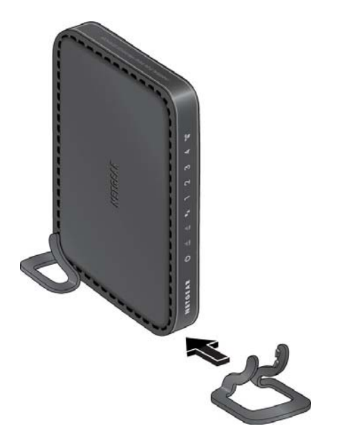
Figure 2. Attach the feet if you want to use a vertical position

The extender comes with two feet in the package. You can attach them as shown so that you can use the extender in a vertical position.