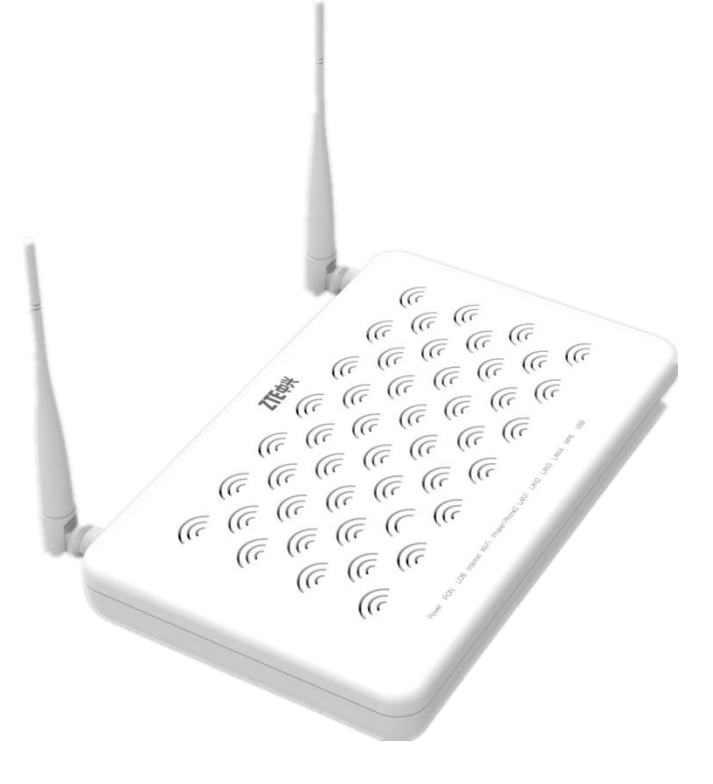
Figure 1-1 The ZXHN F660

The ZXHN F660, a GPON optical network terminal (ONT) for home users, is designed for the fiber to the home (FTTH) scenarios, supports desktop mounting and wall mounting. The ZXHN F660 complies with the ITU-T G.984 standard, provides 2.488 Gbps downlink and 1.244 Gbps uplink at network side, and provides 4GE ports, two Phone ports, one 802.11b/g/n(2*2 @2.4GHz) Wi-Fi interface with two External antennas, one USB port at user side. Home users can easily access voice services, video services and many other kinds of high-speed broadband services by the ZXHN F660's rich interfaces.