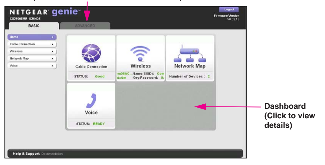
Menus (Click the ADVANCED tab to view more)

When you connect to the gateway, the gateway dashboard (BASIC Home screen) displays.